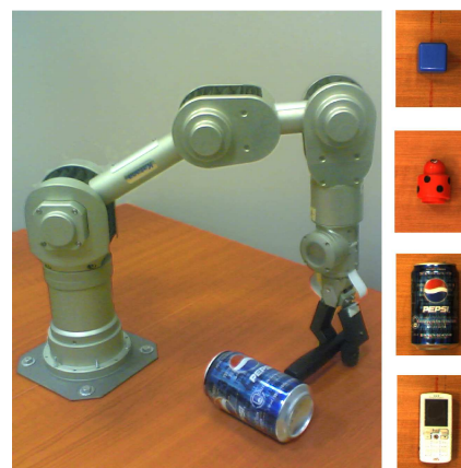
Figure 2: View of the workspace. The robotic arm holds a black plastic tool that is used to push objects on the work surface. Some sample objects are also shown.